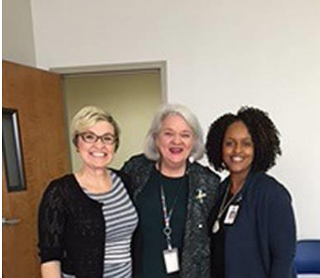
Statistics about family violence