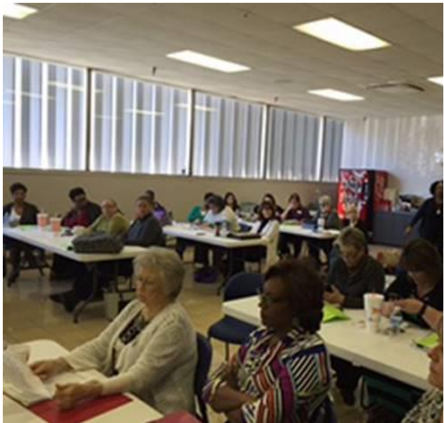
CPS and others at the meeting